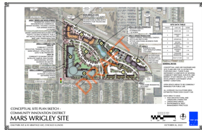
PARTNER IN MARS CO- DESIGN TEAM