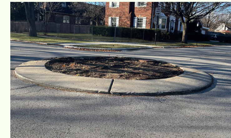
TRAFFIC CIRCLE BEAUTIFICATION